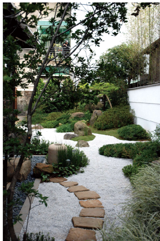
View of Karesansui Garden from the west