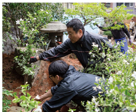
Technical guidance on site by Japanese gardener