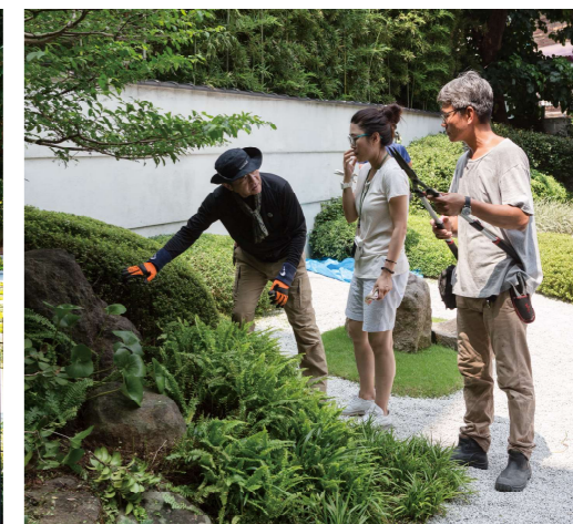
Guidance on garden maintenance and technique