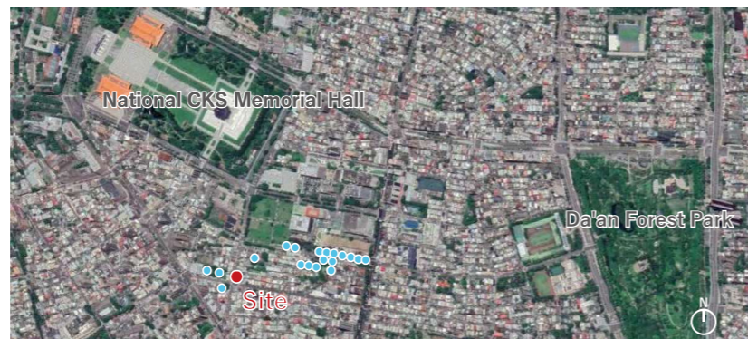
SITE PLAN ● Japanese Dormitories of "Nishiki-cho"

The site is located on the south side of National CKS Memorial Hall, and the area was called "Nishiki-cho". This used to be the residential district for upper-mid ranking officials and there are still many of the old Japanese houses remained as abandoned. The former Japanese dormitory clusters including "LEPUTING" were registered as Taipei City's Historical Buildings in 2006. In 2013, the Taipei City Cultural Affairs Bureau launched the "Old House Cultural Movement" to regenerate these historical buildings and solicited ideas to private companies for restoration and revitalization. This project was born as part of this cultural movement.