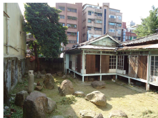
Existing Garden and Building Before Renovation.