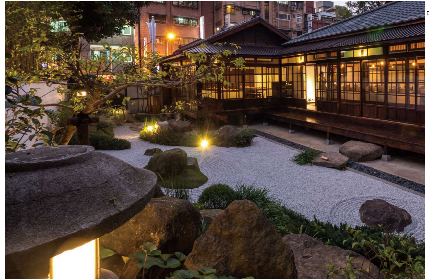
Evening View of the Karesansui Garden