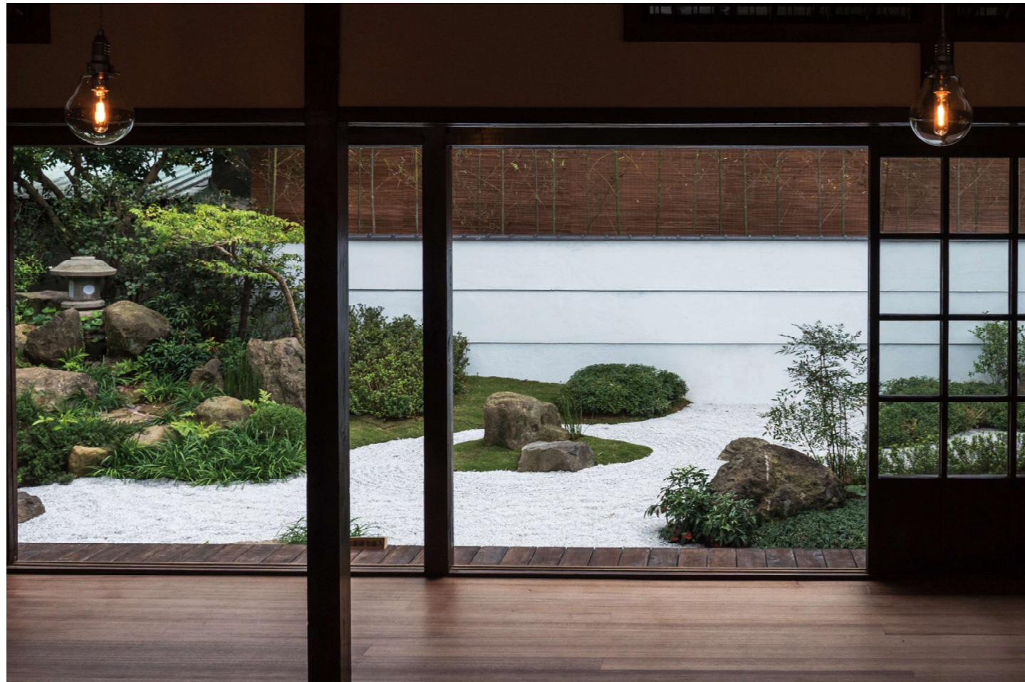
Restored Japanese Garden "Karesansui Garden"