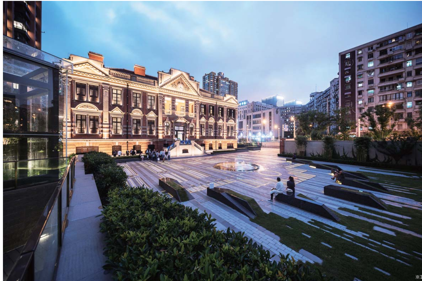
Lawn Square in front of Chamber of Commerce Building

Designed on the motif of the historic waterborne transportation hub of people and goods, the place signifies a renewed bustle blended with riverside nature.