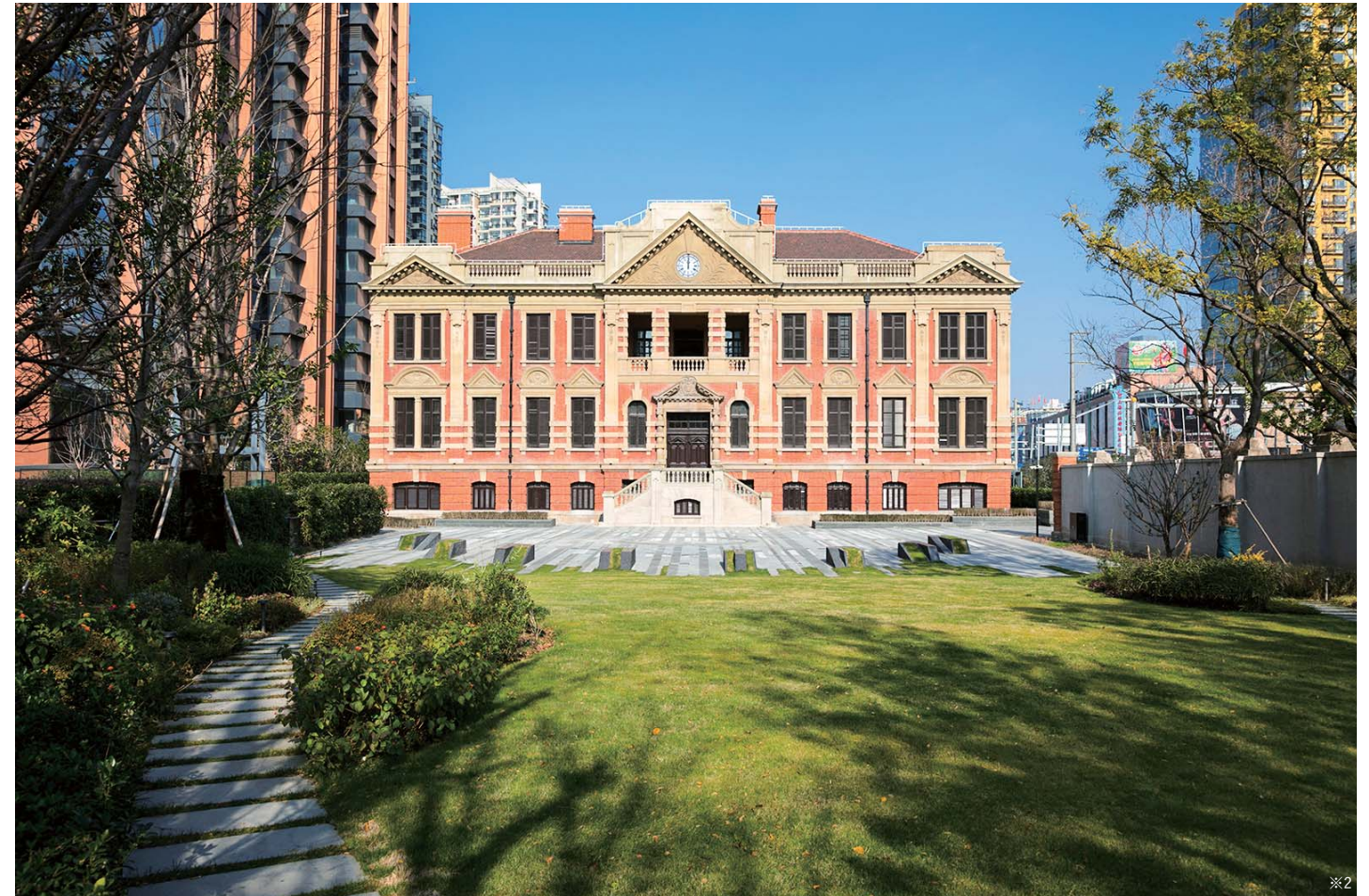
Lawn Square in front of Chamber of Commerce Building

Designed on the motif of the historic waterborne transportation hub of people and goods, the place signifies a renewed bustle blended with riverside nature.