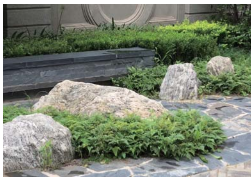
Top: Water Garden Bottom: Shade Garden