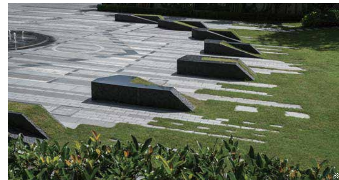
Pavement Pattern in front of Chamber of Commerce Building

Address: No. 33 North Henan Road, Shanghai, China Principal uses: hotel, residence, restaurant, commerce, office Developer: OCT Shanghai Land Architectural design: Foster Associates; Modern Urban Architectural Design Institute Landscape design: Landscape Design Inc. Interior design: Antonio Citterio Patricia Viel Construction: Zhongxin Construction Group Design area: approx. 15,000m 2 Structures: 46 stories above ground and 3 stories underground; 5-story tower building Max. height: approx. 150 meters