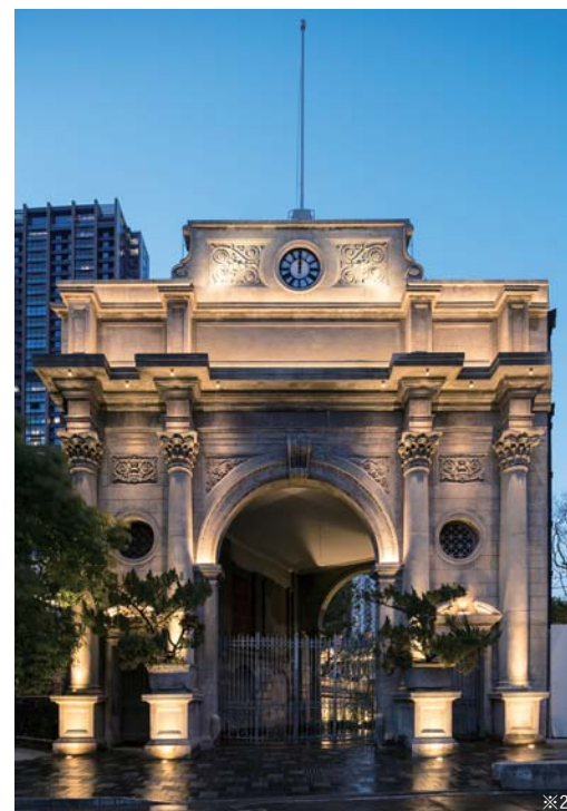
Restored 2-Story Gate