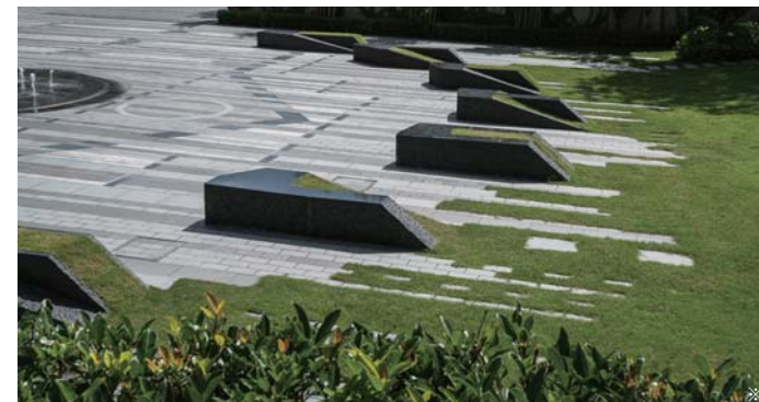
Pavement Pattern in front of Chamber of Commerce Building

Address: No. 33 North Henan Road, Shanghai, China Principal uses: hotel, residence, restaurant, commerce, office Developer: OCT Shanghai Land Architectural design: Foster Associates; Modern Urban Architectural Design Institute Landscape design: Landscape Design Inc. Interior design: Antonio Citterio Patricia Viel Construction: Zhongxin Construction Group Design area: approx. 15,000m 2 Structures: 46 stories above ground and 3 stories underground; 5-story tower building Max. height: approx. 150 meters