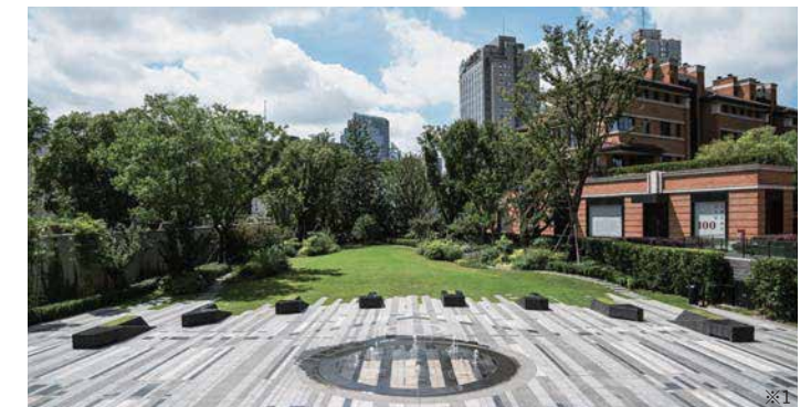
Lawn Square in front of Chamber of Commerce Building

Gradual transition from pavement to lawn.