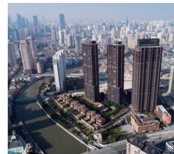
Whole View of Development Area

Suzhou Creek's downstream area had been left behind from development and turned partially into a slum until Shanghai City designated it as an urban renewal area. A local developer OCT made investment to initiate the area's development, the leading project for which was Bvlgaria Hotel Shanghai.