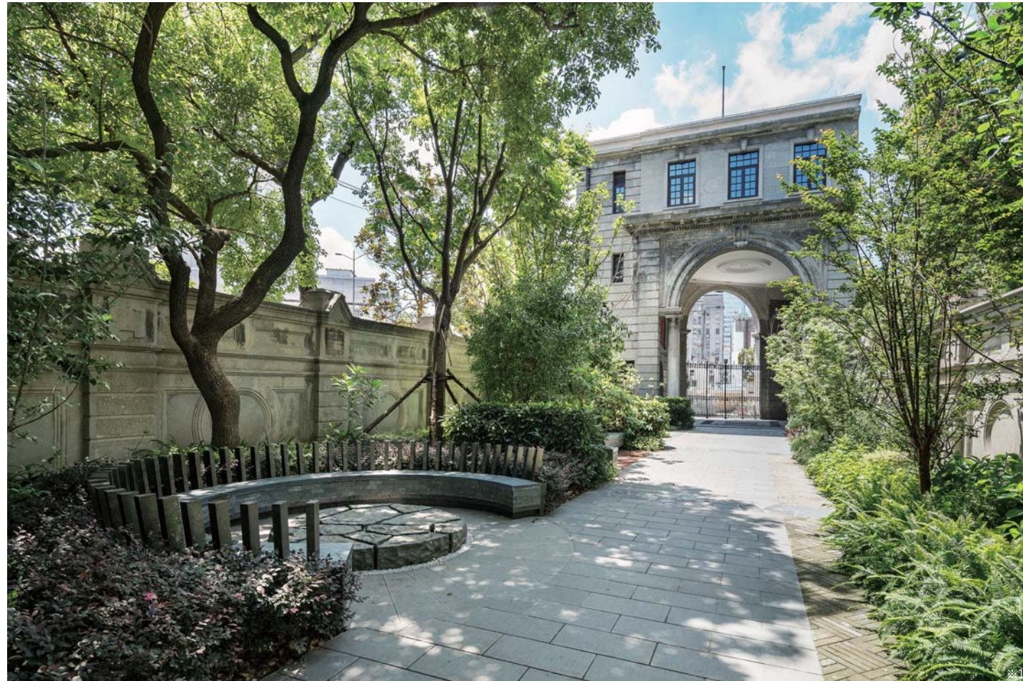
Seven Gardens & 2-Story Gate

Gardens created under 7 different themes, including Water, Edible (fruits), Sound, Fragrance, and Shade.