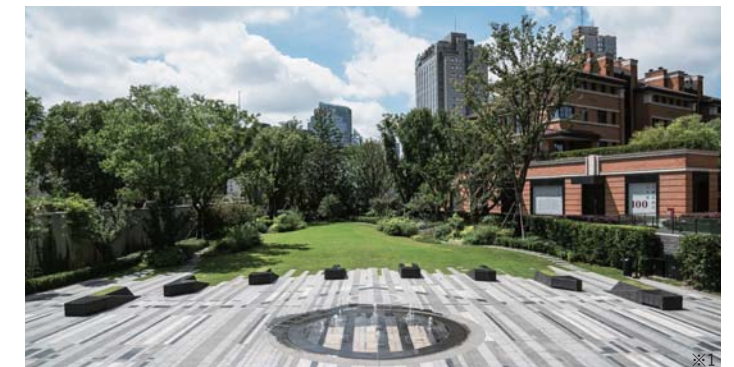
Lawn Square in front of Chamber of Commerce Building

Gradual transition from pavement to lawn.