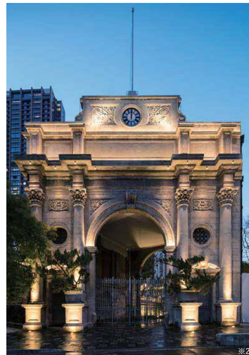
Restored 2-Story Gate