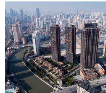
Whole View of Development Area

Suzhou Creek's downstream area had been left behind from development and turned partially into a slum until Shanghai City designated it as an urban renewal area. A local developer OCT made investment to initiate the area's development, the leading project for which was Bvlgaria Hotel Shanghai.