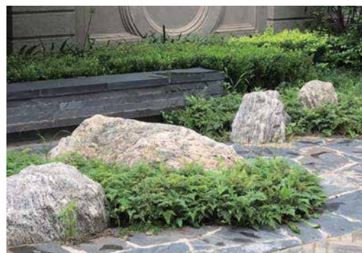
Top: Water Garden Bottom: Shade Garden