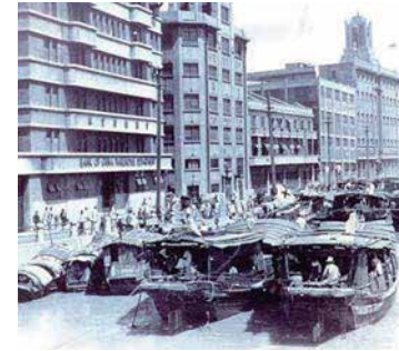
Suzhou Creek around 1940