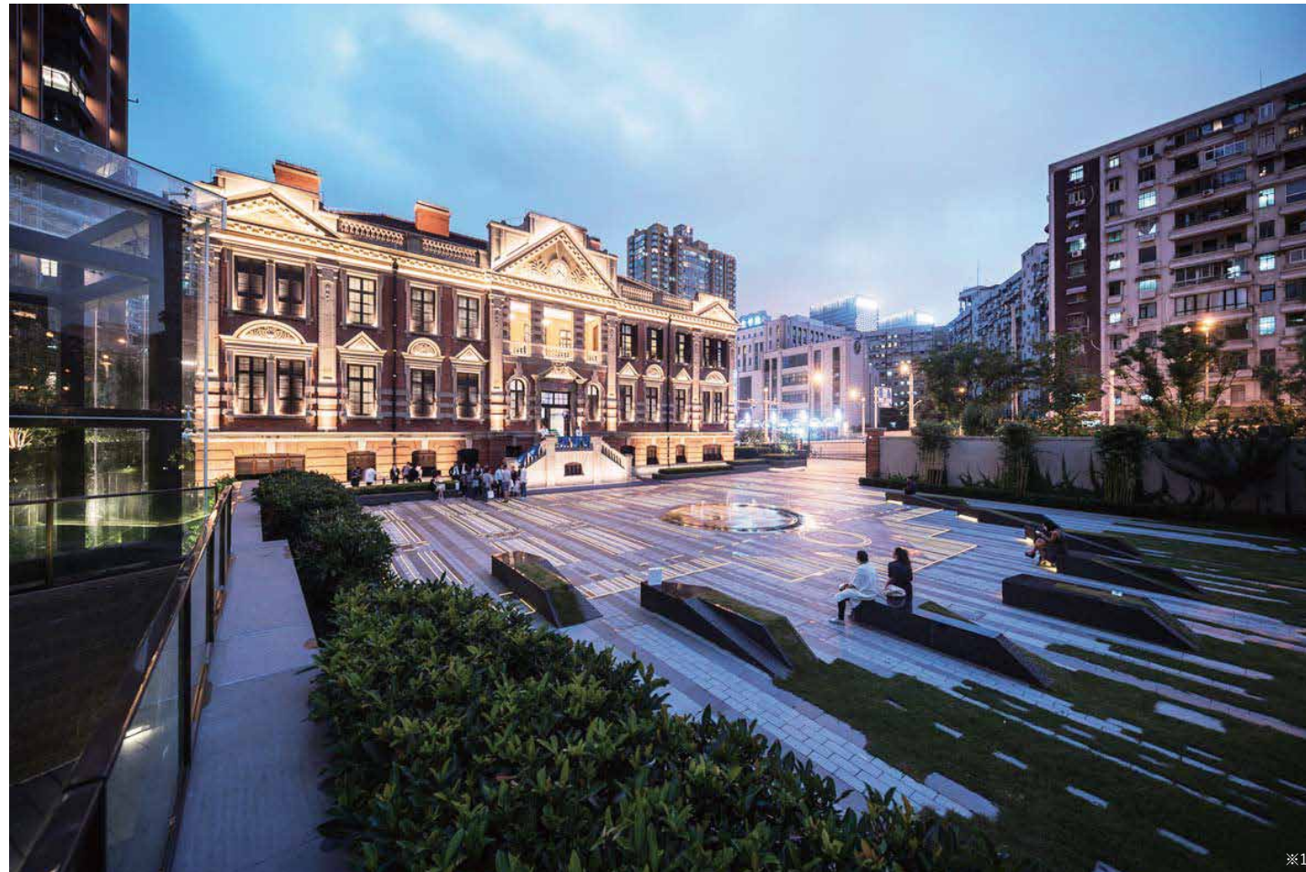
Lawn Square in front of Chamber of Commerce Building

Designed on the motif of the historic waterborne transportation hub of people and goods, the place signifies a renewed bustle blended with riverside nature.