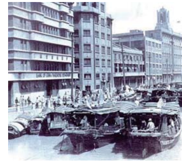
Suzhou Creek around 1940