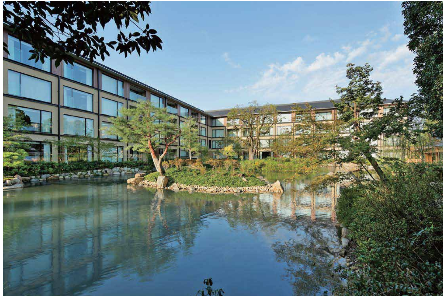
North Wing and Small Islands of the Pond Garden The Pond Garden of Heian-Period welcomed the Emperor with musical performance on a boat during his visits.