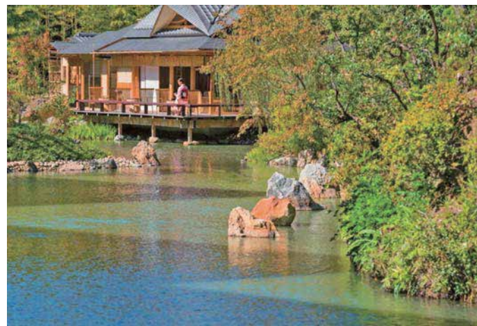
Yodomari-ishi Stone were arranged to resemble the boats crossing to the Sacred Islands.