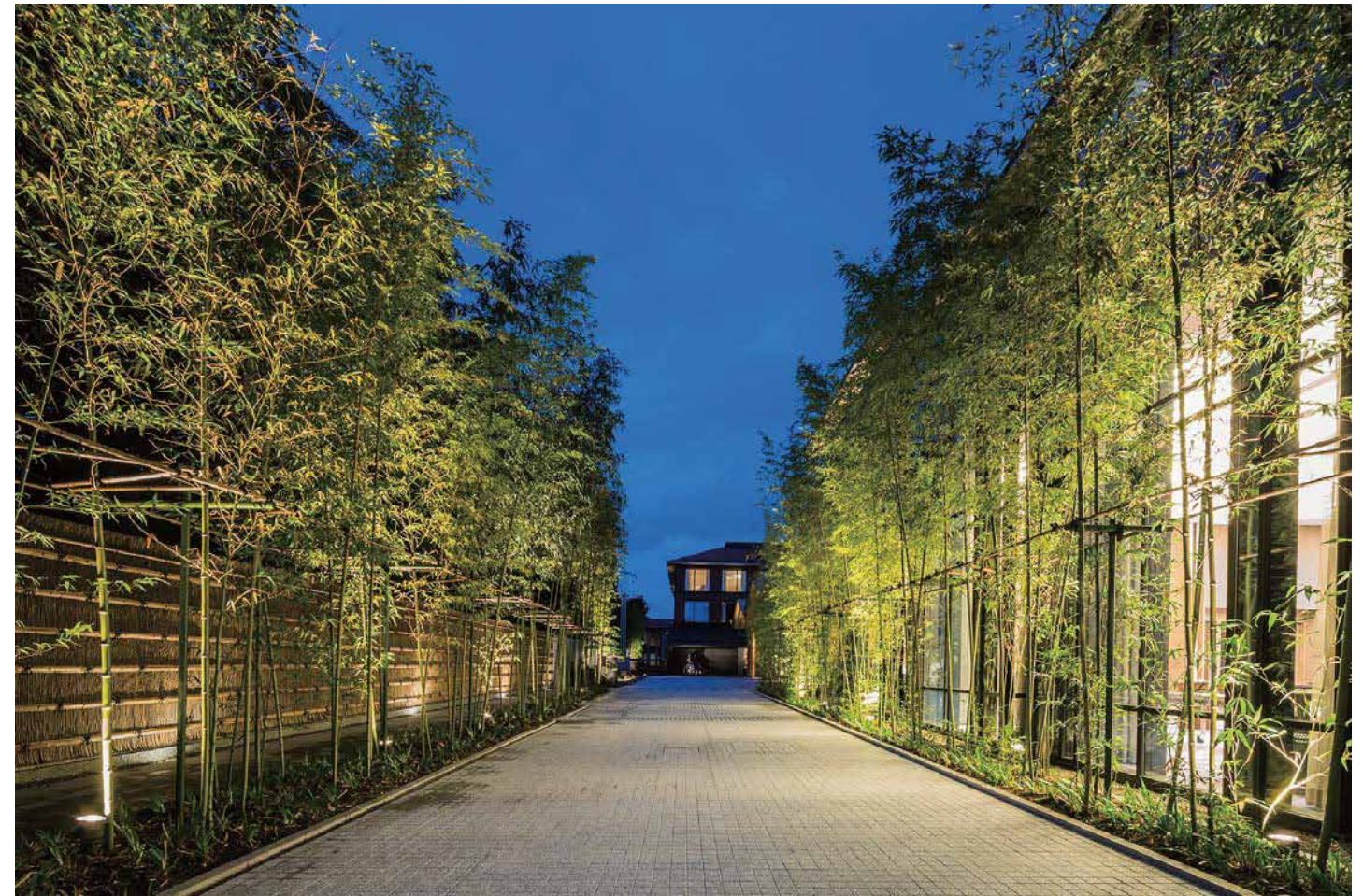
Bamboo Forest Approach A 100m long Bamboo Forest approach to the hotel secures tranquility from the bustling urban setting.

The guest rooms are located where the historical villa used to be placed, so as to beautifully capture the whole garden scenery and pond landscape from the rooms. The serenity of the landscape setting together with crystalline water pond creates a fabulous location for the celebration of Kyoto garden culture and Japanese traditional cultural events and seasonal festivities, such as cherry blossom viewing, moon viewing, snow viewing, tea ceremonies and banquets in this unique modern Kyoto garden setting .