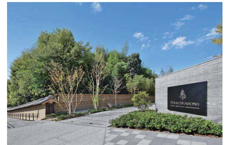
Main Entrance Gate In order to harmonize with the roofed-mud wall of the adjacent Temple, natural ashlar stacking was used for the Entrance Gate. And the Security Room is contained within the walls.