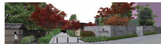
Entrance Gate Scenic Simulation