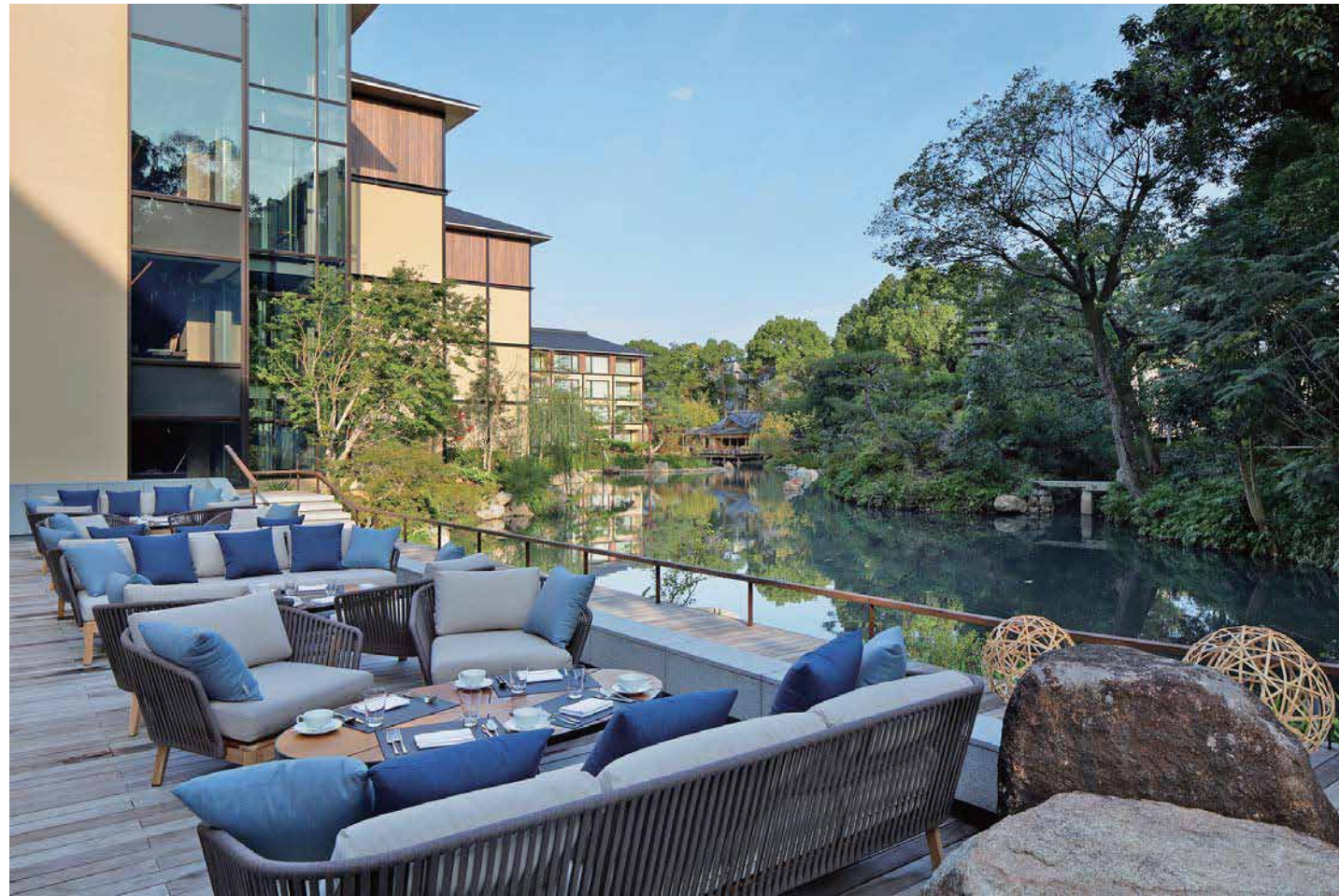
Restaurant Terrace A modern day moon viewing terrace to enjoy the seasons in the Garden.