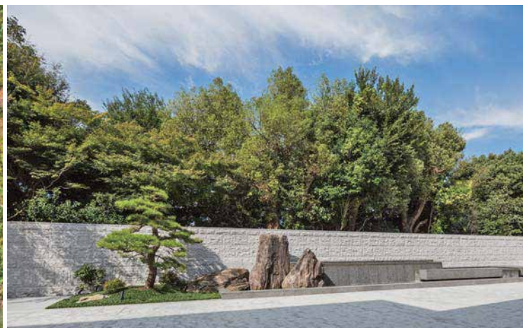
Focal Water Fountain Water feature represents the Higashiyama's Water Spring with the adjacent Temple's forest as a backdrop.