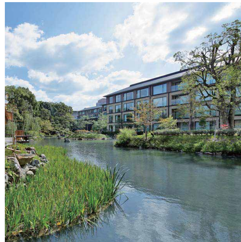
View of the Garden from the Tea House Guest Room Wing oriented where the main room of the villa used to be, to secure the view of the whole Garden.